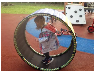
Greenwood Nursery Unit

Greenwood Nursery is an integral part of Greenwood Primary School. The nursery caters for 52 children in their pre-school year, operating two separate sessions per day. The nursery classroom is well equipped and there is also a range of equipment available for outdoor play and learning. As well as the enclosed outdoor nursery space, the children also make use of the extensive garden area and the main school hall.